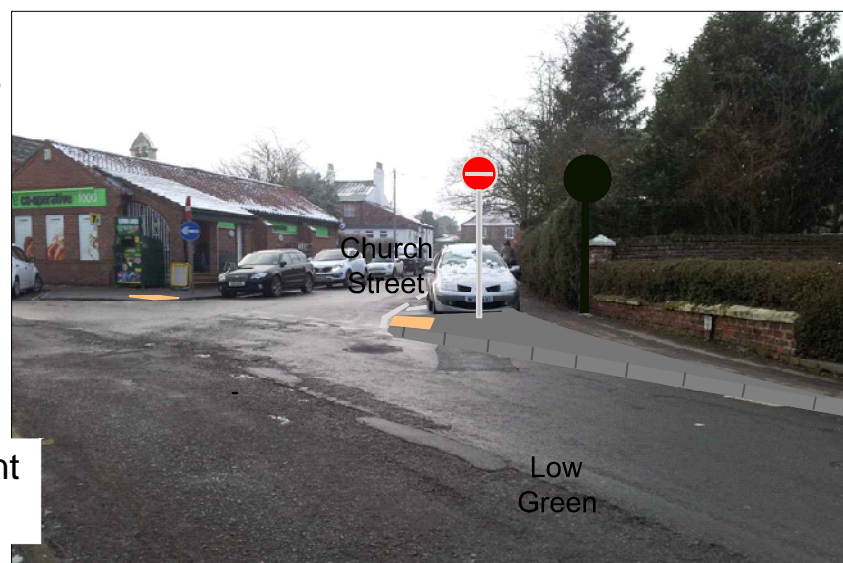
Copmanthorpe - Church Street / Low Green junction - Indication of how the footway build-out may look - not to scale

© CROWN COPYRIGHT. City of York Council OS Licence No. 1000 20818